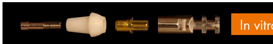
Image*: Components of the zirconium oxide hybrid abutment with implant analogue

The laboratory study at the University of Kiel also showed that the sterilisation of zirconia hybrid abutments (bonded with DTK adhesive) has a positive effect on tensile strength, regardless of whether temperature load changes were performed afterwards or not. The study also shows that very good clinical bond values are achieved by conditioning using either 50 µm or 100 µm corundum blasting at a pressure of 1 or 2 bar.