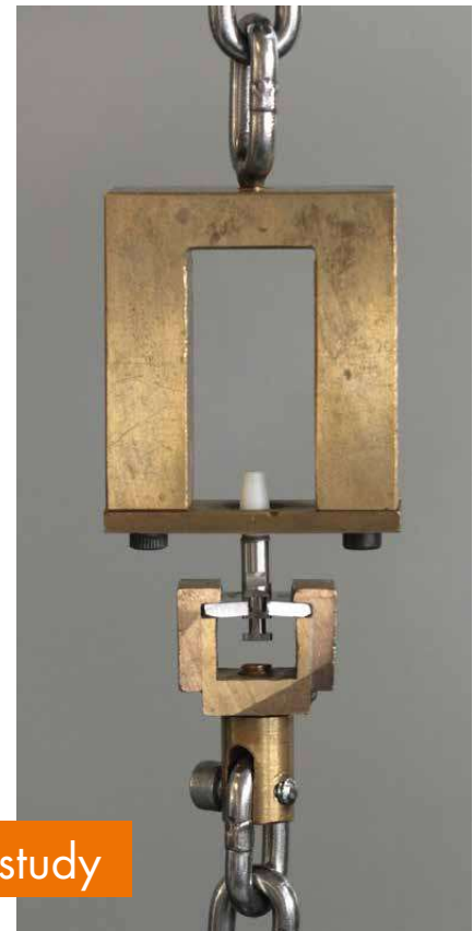
Image*: Test setup – tensile strength test (crosshead speed of 2 mm/min)